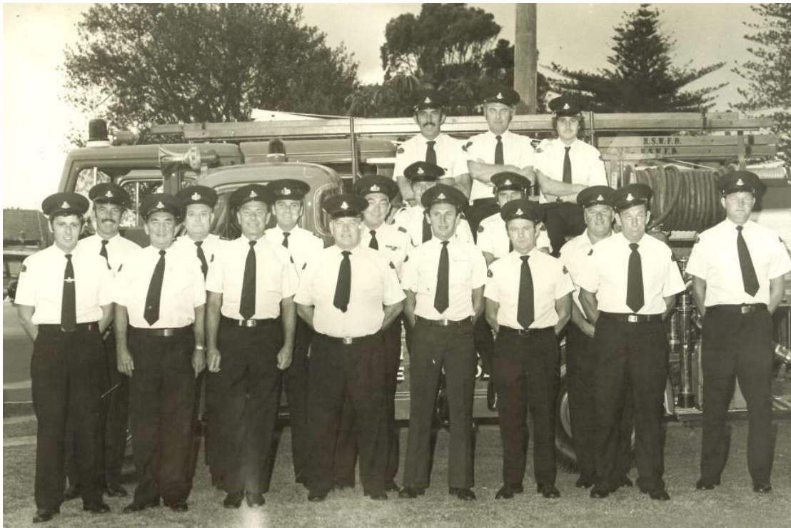
Port Macquarie Fire Brigade 1980

In 1840, construction commenced on the "Wool Road" from the Northern Tablelands to enable wool and other produce to be shipped from the area. Port Macquarie was declared a municipality in 1887 however the town never progressed as a port due to a notorious coastal bar across the mouth of the river.