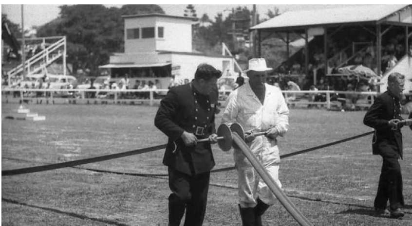
Fire Brigade's Demonstration, 1964

Win or lose, he said, all those competing can be assured that their efforts would be a stimulus to others and a further contribution has been made to the cause of fire prevention.